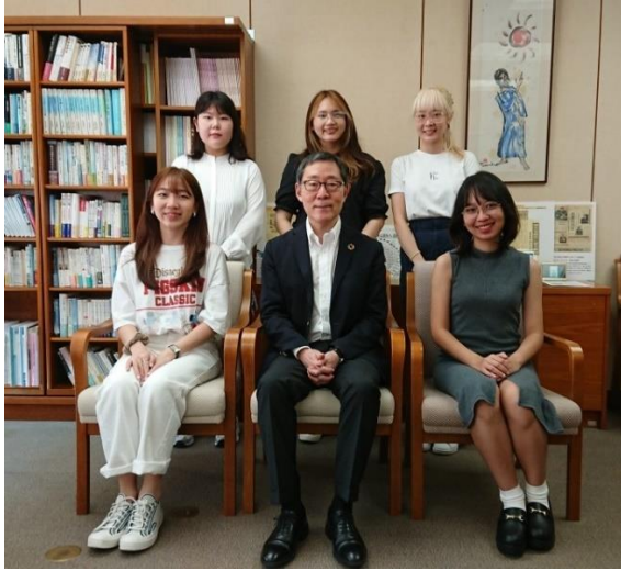
Welcome Meeting with President